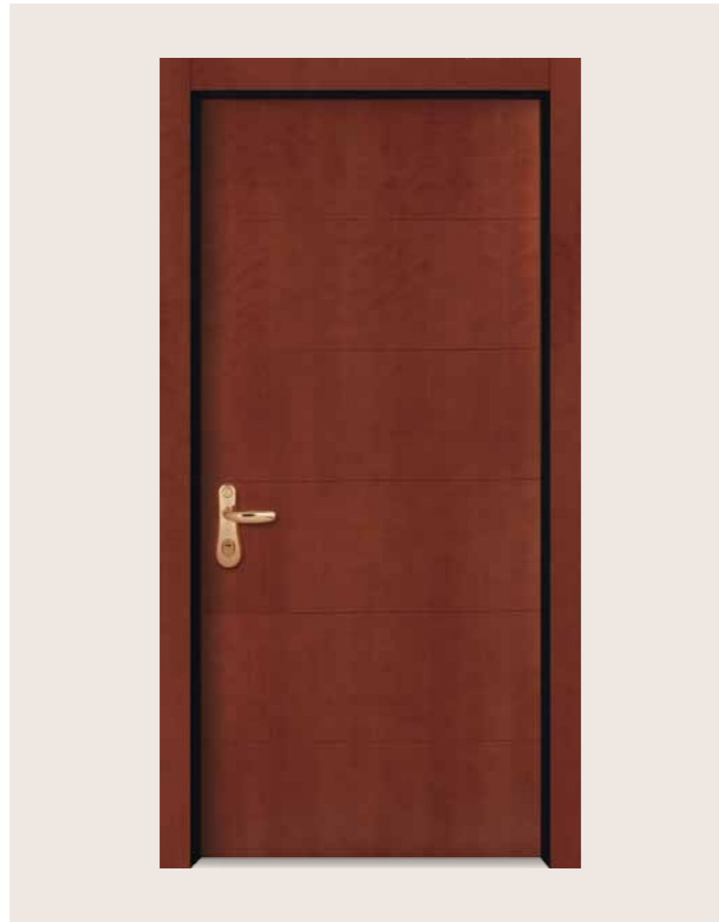
SUPERLOCK 6040 | Cherry veneer

The pictures are for illustration only. There may be differences between the look and colors of the doors in the picture, and in reality.